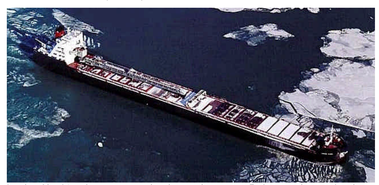
London, Mar 31 — A press report, dated yesterday, states: Early yesterday evening the bulk Canadian Olympic (22887 gt, built 1976) had a power failure while upbound in the Amherstburg Channel. Anchors were dropped, but the vessel grounded with her stern