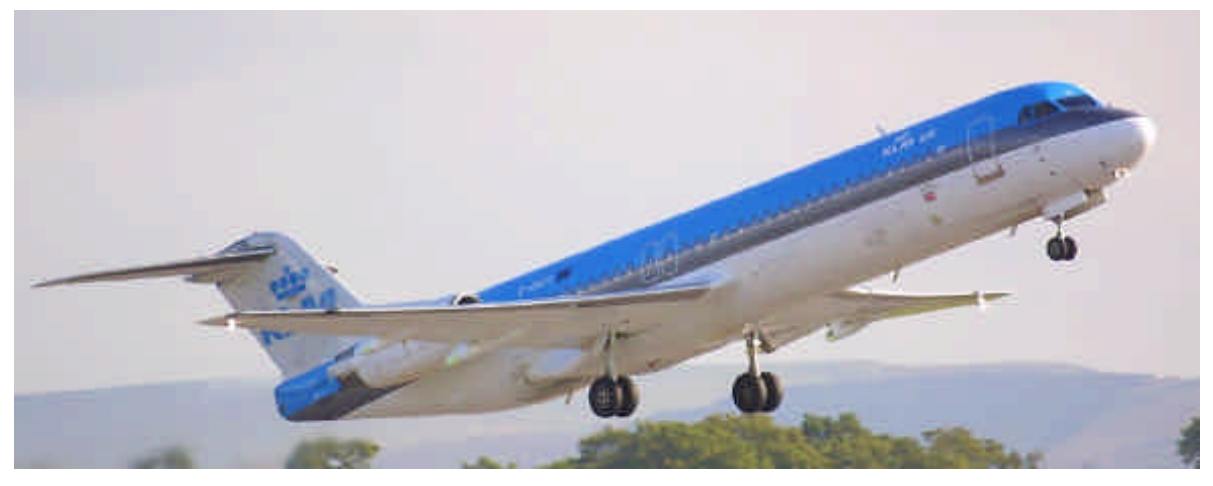
top: a KLM-UK Fokker 100 during take off at Manchester

MANCHESTER - De inzittenden van een vliegtuig van luchtvaartmaatschappij KLM zijn maandagochtend op het vliegveld van Manchester geëvacueerd, omdat er rookontwikkeling was in één van de toiletten. Vijf passagiers van de in totaal 94 personen aan boord raakten lichtgewond, aldus een woordvoerster van de KLM.