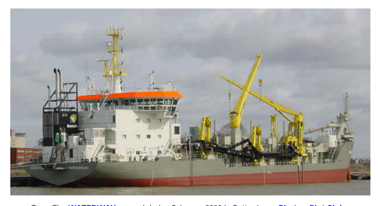
Top: The WATERWAY moored during February 2002 in Rotterdam

This title is awarded by the Royal Netherlands Association of Maritime Technicians (KNVTS). The Waterway has won partly because of the unique partnership between its buyer, Boskalis, and its builder, De Merwede.