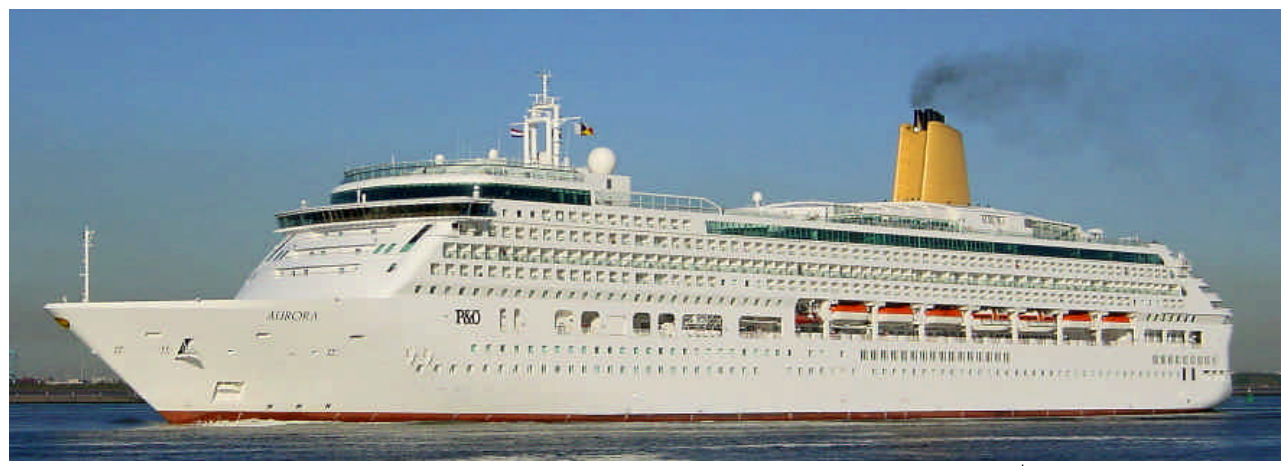
Finally a Passenger vessel arrived again to visit the Port of Rotterdam, Saturday June 1<sup>st</sup> the AURORA of P & O Cruises passed Hoek van Holland inward bound for the Wilhelmina kade in Rotterdam, the ship departed again during the afternoon.